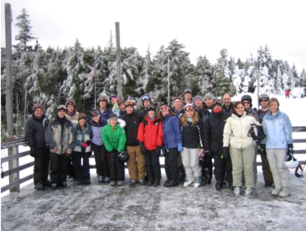
Okemo Trip – January 2008