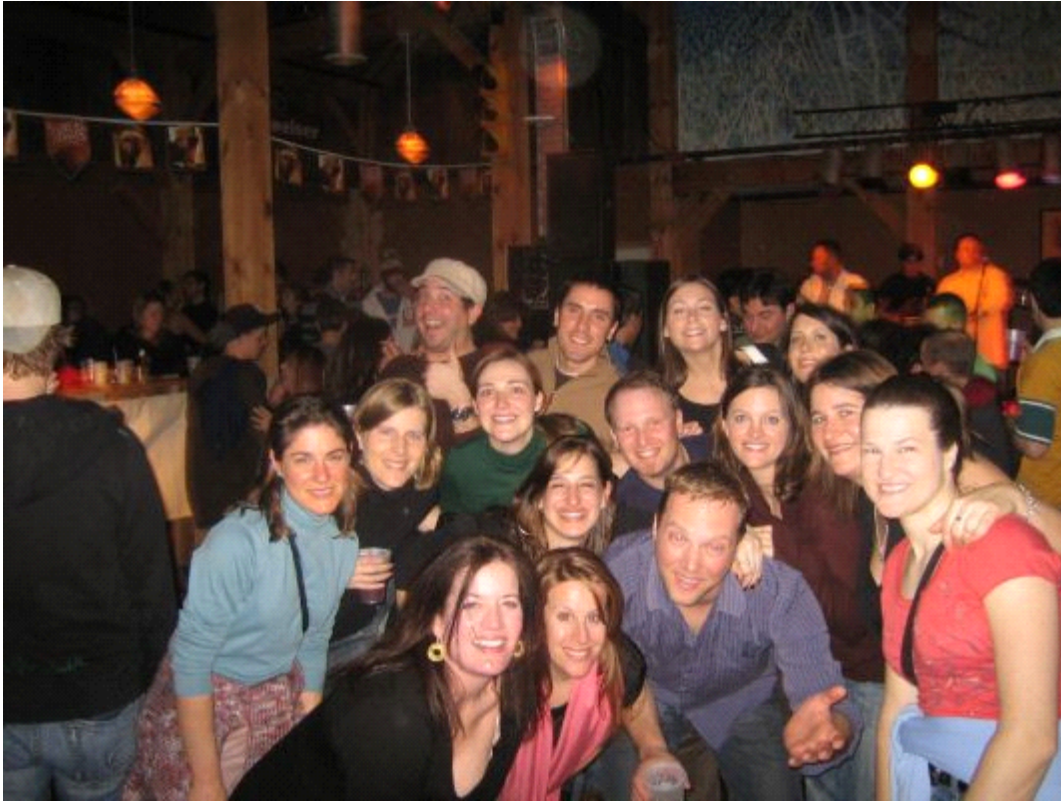
Stowe Presidents Weekend – The Rusty Nail night spot never disappoints